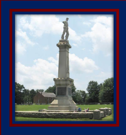
23 rd NJ Monument at Salem Church