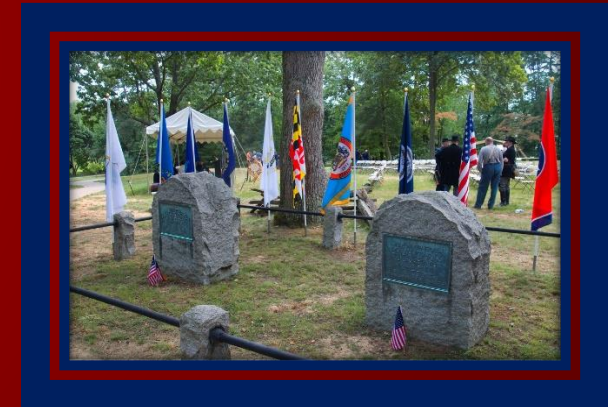
OX Hill Park