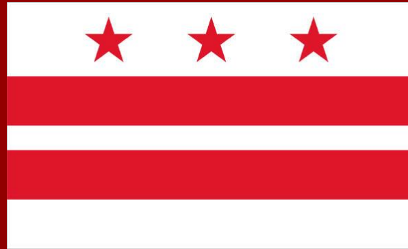
District of Columbia